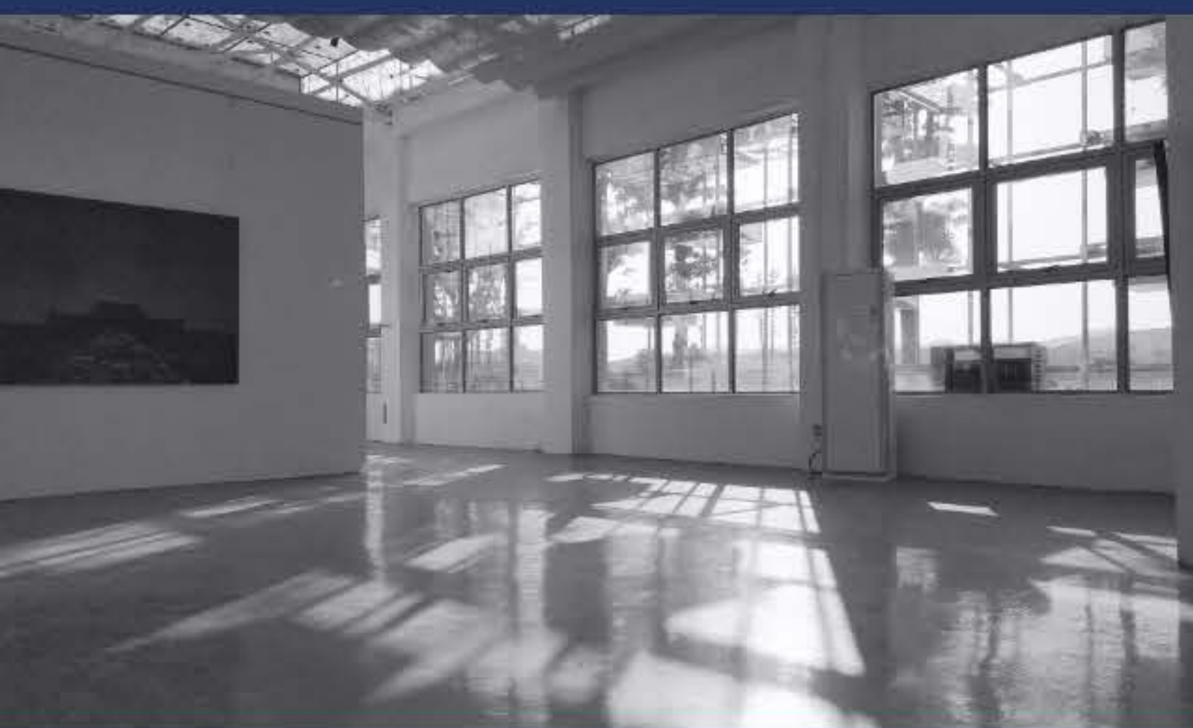
Curatorial Research in Exhibition Studies Cristina Moraru